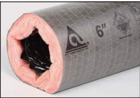
UPC #070 R-Value 4.2